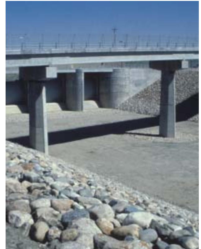
The St. Mary reservoir channel near Spring Coulee, Alberta, after 66 days with no rainfall, summer 2001.